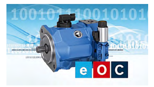
Electronically controlling hydraulic pumps in open circuits with Rexroth eOC opens up new possibilities for hydraulic drives. Shifting complexity from the hardware to the software makes machines even more flexible and productive.

The stability of the function in the application is increased. In addition, performance benefits in the component and in the system cluster increase efficiency. Energy recuperation solutions become possible or simplified.